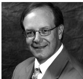
Board Page 4