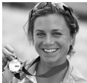
Events Page 6