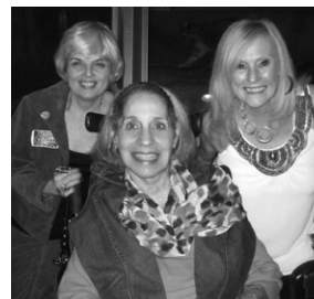
Volunteers Page 16